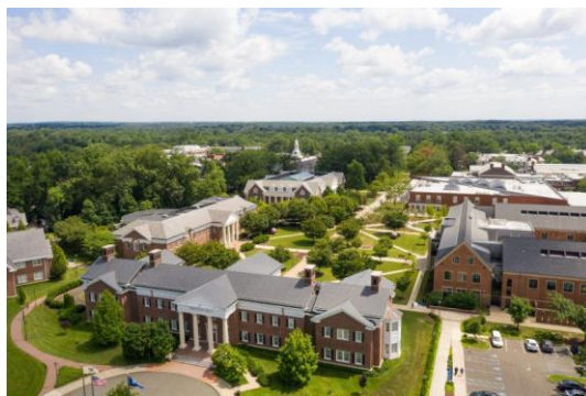
Aerial view The College of New Jersey

Presenters from 2019 conference will be able to log on with the same credentials; new users will be asked to create a profile before reaching the submission page. You will need to supply: x Title of individual paper, panel, or workshop (specify which); x Your name (panel and workshop proposals must include the names, institutional affiliations, and paper titles of all presenters); x Your institution and position (faculty, graduate or undergraduate student, or other); x A 250-word abstract in English, Spanish, or Portuguese. Applicants will be informed by Friday, February 18 whether their proposals have been accepted. MACLAS offers prizes for the best book and best article or chapter published by a member in the last two years, as well as prizes for the best graduate and undergraduate papers presented at the conference. Graduate students are encouraged to apply for a Christina Turner Travel Award to help defray conference costs. See details on the MACLAS website: www.maclas.org . Conference registration fees are $125 for the full conference or $75 for one day if submitted by February 25, 2022. After this date, the fees are $175 for the full conference or $100 for one day. In order to appear on the program, conference participants must be current members of MACLAS. Annual dues range from $15-$50, depending on professional status and income.