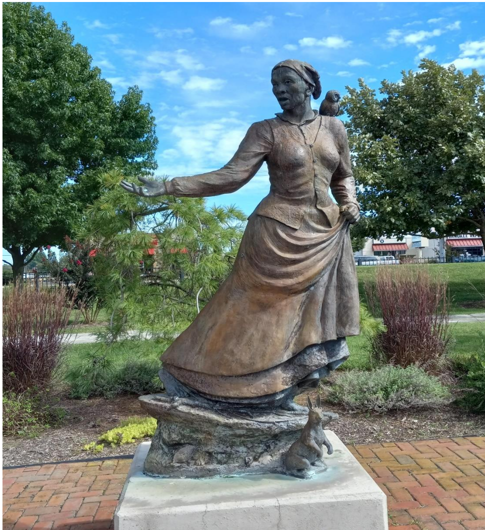
Statue of Harriet Tubman on the campus of Salisbury University.