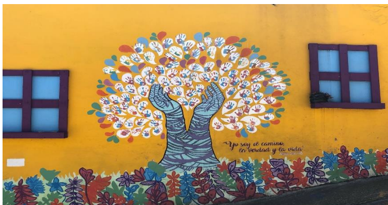
Bogotá 2022.

The office of Vice-President is open for nominations. The Vice-President plays an important role in organizing the conference and the prize committees, among other responsibilities. The Vice President is also President-elect for the following year (MACLAS Constitution 4.4: http://www.maclas.org/team ).